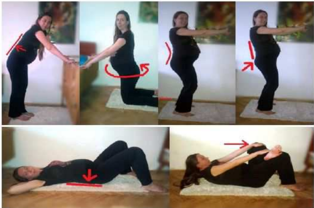
Fig. 3 Complex of daily exercises

In addition to back pain, other pains appeared as well. They were in the lower abdomen, in the pelvis and pubic bone and also numbness and pain in other joints of the body. Rarely appeared headaches and pain in the heart area. This was due to the lack of preparedness and functionality especially of back muscles, weight gains and consequently incorrect postures, ending up hyperlordosis (Lipton, Tunks, Zoppi, 1990).