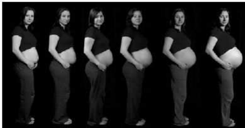
Fig. 1 Pregnant woman in weeks 16, 21, 25, 29, 33 and 37

All these changes together can also trouble a quite healthy body. In the case of already existing risk factors such as obesity, poor posture, overloading or congenital disposal, even a small change can start an avalanche of problems. Once again, we have to accentuate the fundamental mistake - boundless calorie intake in pregnancy. This can cause weight gain from 50 to 100% compared to natural pregnancy increase.